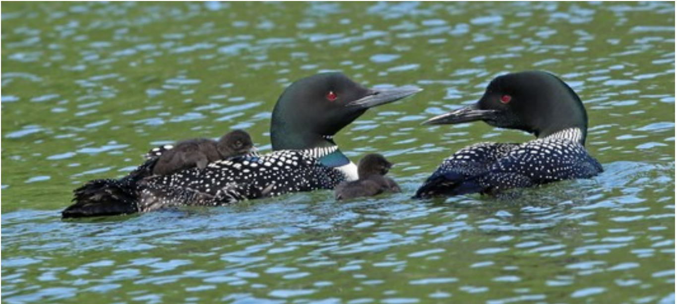
This pair of Loons with day old chicks were taken at our lake in Minnesota in June. The chicks often ride on the parent's back when very small.