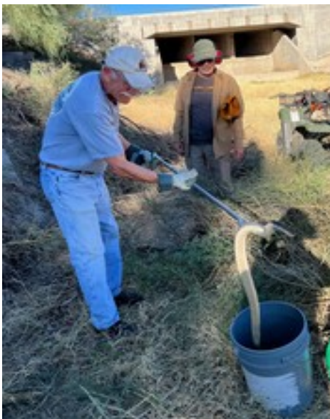
This photo was taken 11-7. Always a surprise to come upon a 3 1/2-foot Diamondback rattler when working on the grounds volunteer crew.! Removed the snake to a safe location.