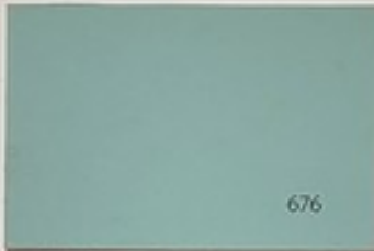
Spirit in the Sky #676

Houses, Stucco walls, Garage doors must be painted with Benjamin Moore "clay" #1034 in flat finish. Garage doors only may be either flat or satin finish