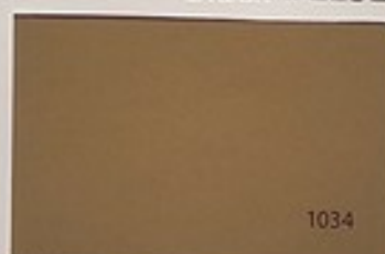
Clay #1034 -flat finish (for Stucco)