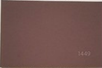
Pinch of Spice #1449