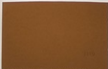
Fort Sumner Tan #1119 (for wood)