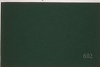
Gondola Ride #602