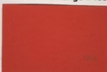
Ryan Red #1314