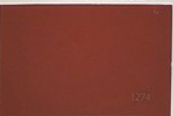
Warm Earth #1274