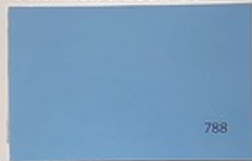
Aquarius Blue #788