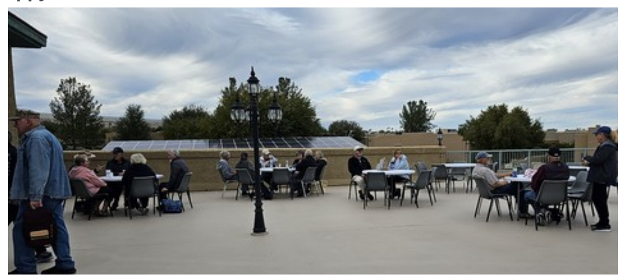
About 35 residents attended the first Happy Hour of 2024. Not our usual sunny weather but still doable outside.