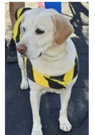
Who needs a chill pill?