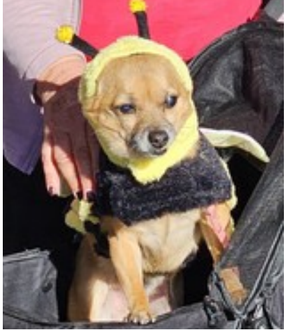
Mom, I don't like them!