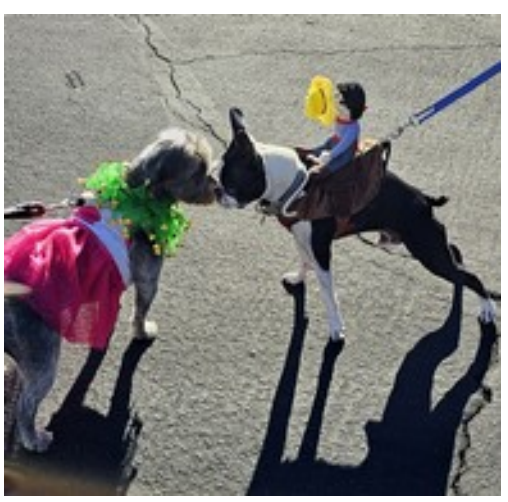
No way, YOU move!