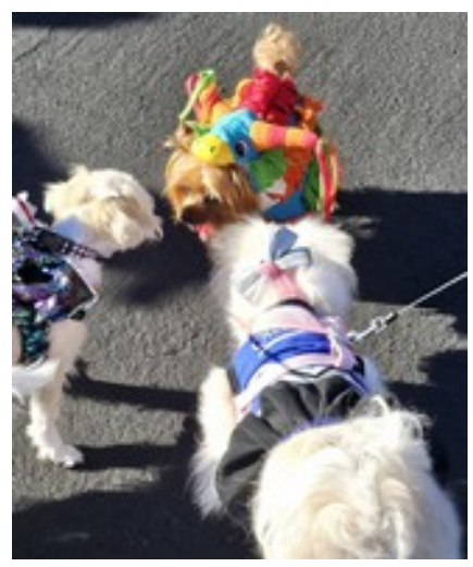
Did you see Agent 007 ?