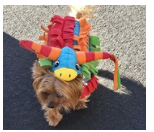
Yikes, don't let them know I'm a pinata