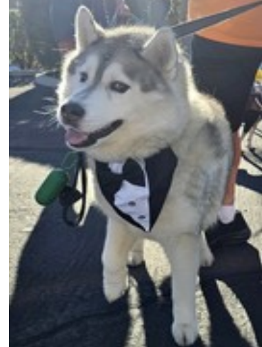
Yes, Ladies, Bond....James Bond