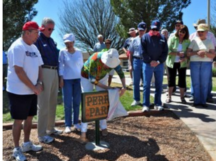
The unveiling of the Perry Park Plaque