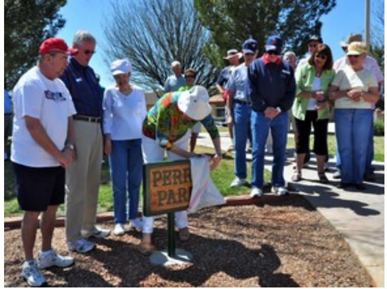
The unveiling of the Perry Park Plaque