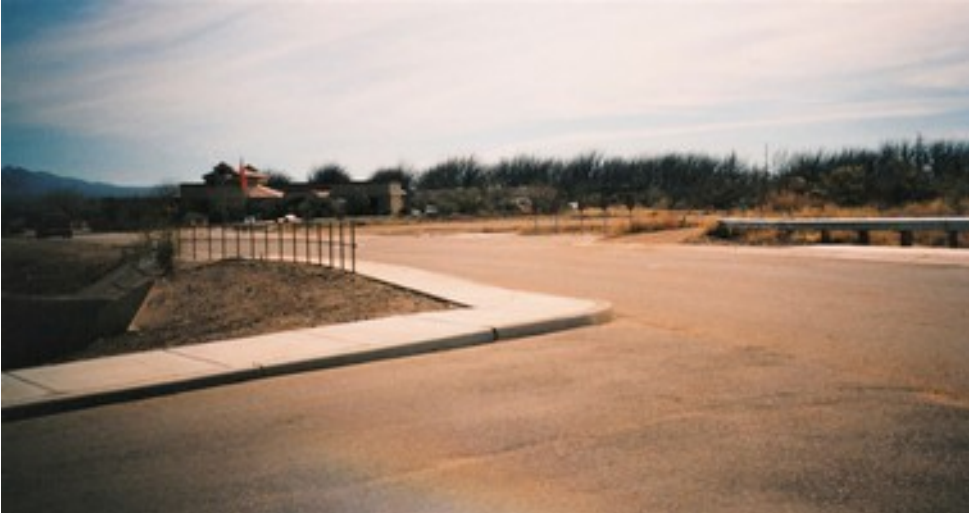
1997, view from the Rec center and the corner of Heroe.

After touring the models and being driven around via golf cart to view possible building lots, I decided that having a home built long distance, (I was from upstate New York), with decisions about counter-tops, paint colors, fixtures, etc. was too much to handle. I loved the area and the mountain views and the friendliness of all I met.