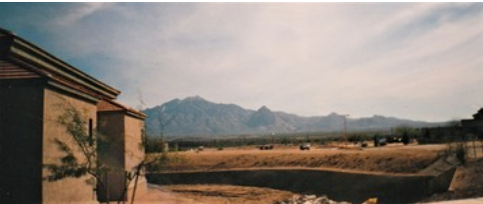
1997 Mountain view the empty land where the Springs phase II will be built, and yes there were many trees to clear.

Fall of 1997 View of the rec center from what would be S. Golfista and the new models.