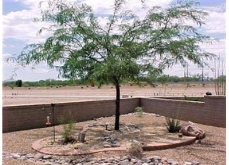
Looking at the future La Fonda and Blue Fox.

There were very few full time residents here in the Springs. We met people walking dogs, swimming in the pool, evening walks with large groups of javalinas! Everyone was friendly and loving their retirement here. There were many "pie" nights. (Costco's huge pies shared by calling folks to share). Margarita's enjoyed with neighbors to watch the mountains turn pink. Numerous trips to Tiny's, a cowboy restaurant and bar on Ajo and Kinney Rd, to enjoy their chicken wings special. Pot lucks were held outdoors on the upper deck of the Rec. Center. On the 4 th of July, we had an unobstructed view of the "A" Mountain fireworks from the upper deck!