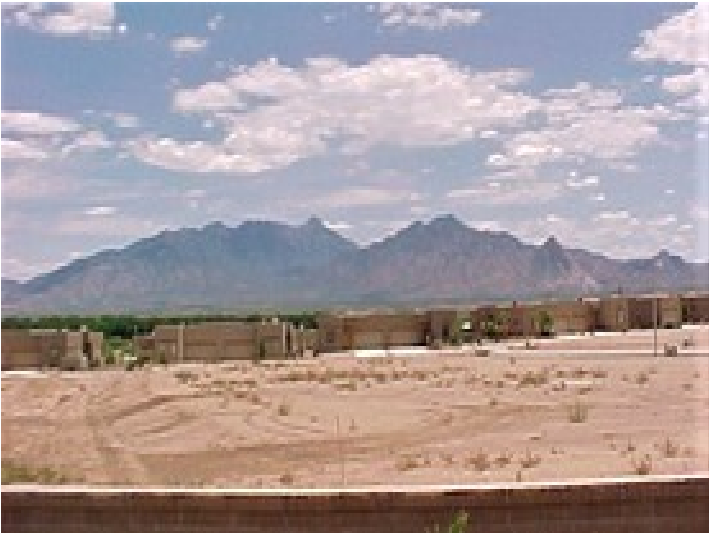
2001-2003 Golden Lynx