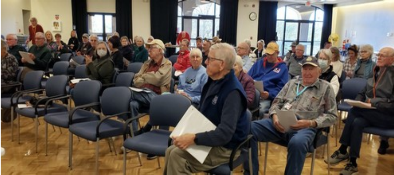
About 50 residents in attendance