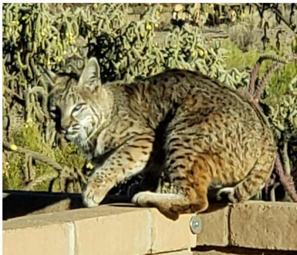
Folks have seen more bobcats recently.

Please email The Springs Office or contact a computer competent friend if you need help.