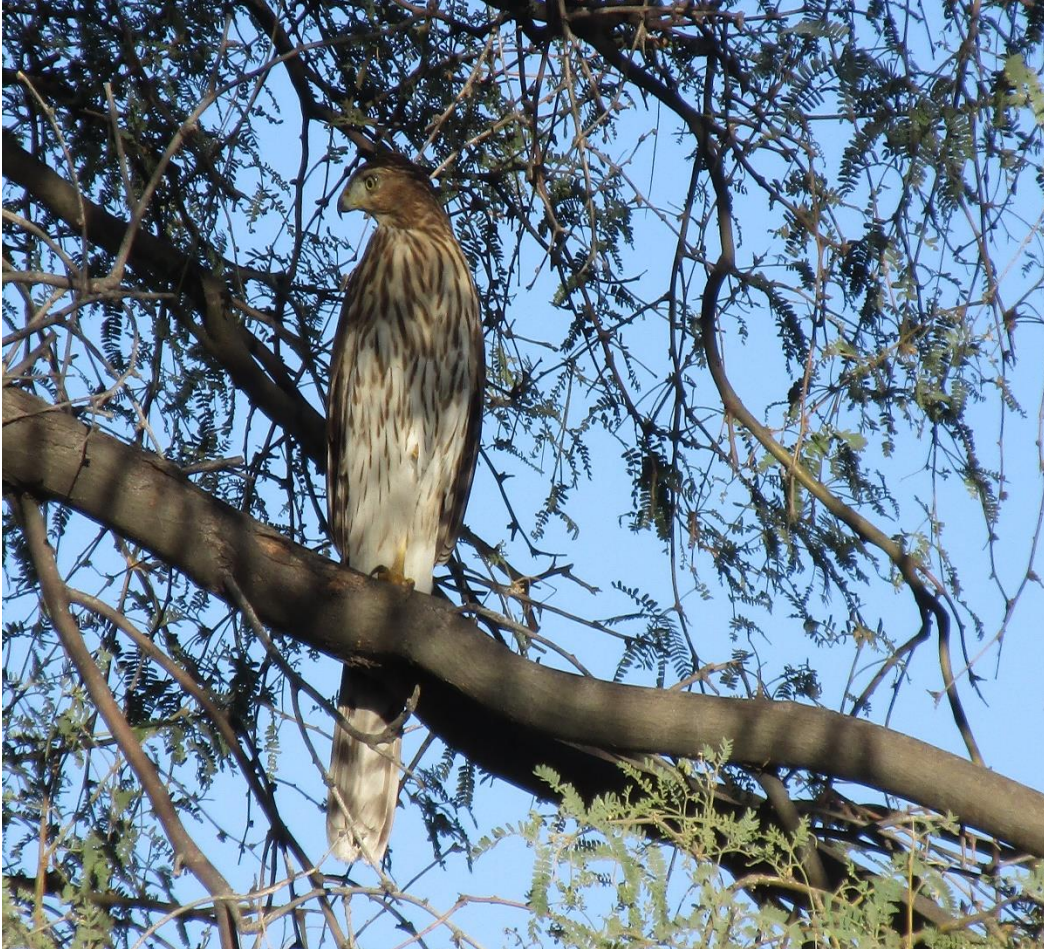
Cooper's Hawk juvenile looking for his next meal.

951 West Via Rio Fuerte, Green Valley, AZ 85614