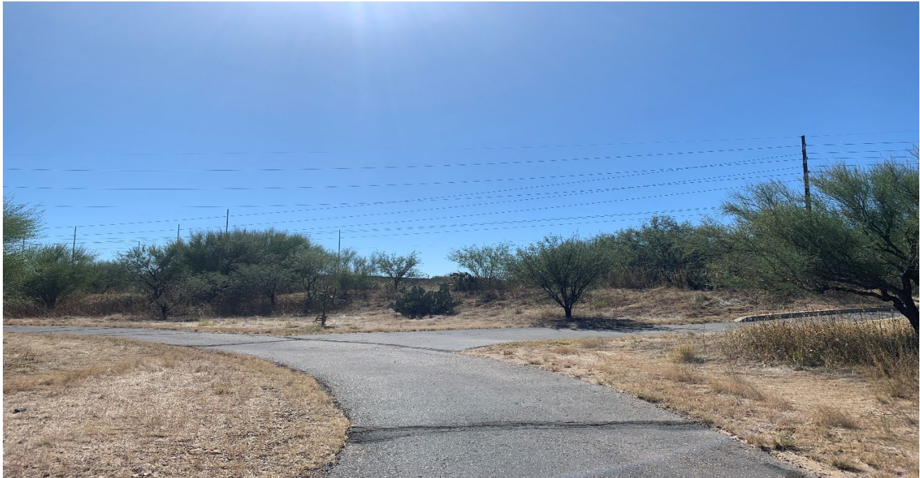
Grass and brush in the extended zone/Undeveloped land. Recommend making contact with land owner/city to take steps to manage or maintain.