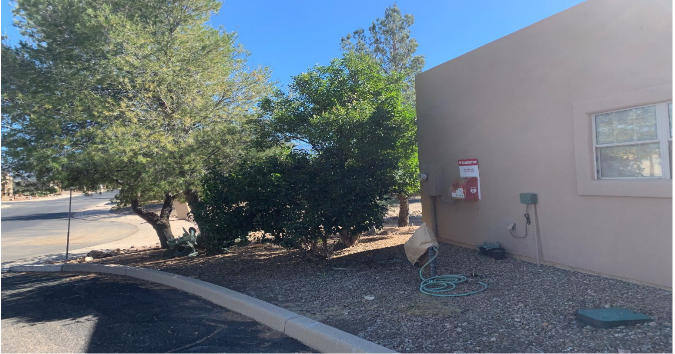
Vegetation in the Intermediate zone. Keep separation of Trees/ Bushes around 5' along with grass trimmed.